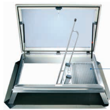
Grid with ladder brace