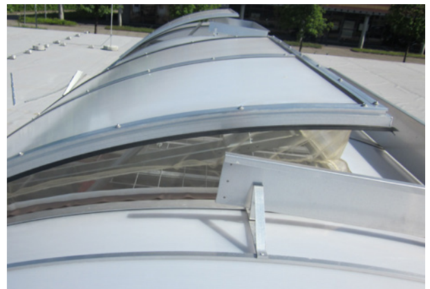
JET continuous rooflight flap in ventilation position with JET insect screen system