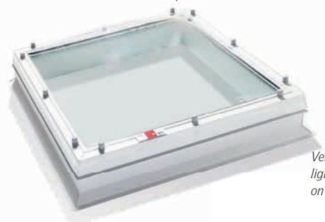
Ventable dome rooflight glass, mounted on PVC AK upstand 16