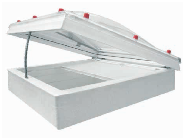
Dome rooflight GLASS mounted on steep GRP AK upstand 30 cm, with concealed 230V drive and shadowing system, including a handheld radio remote control