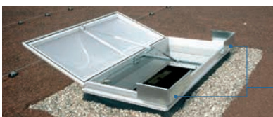
SHEV dome rooflight with wind baffles for optimized aerodynamic efficiency