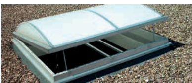
VARIO light flap with SHEV device and electrical motors in ventilation position