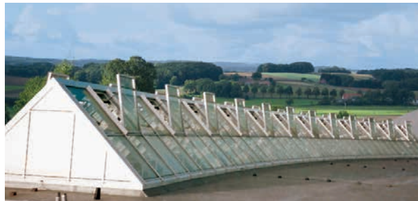
VENTRIA TG flaps installed in a dual pitched solution