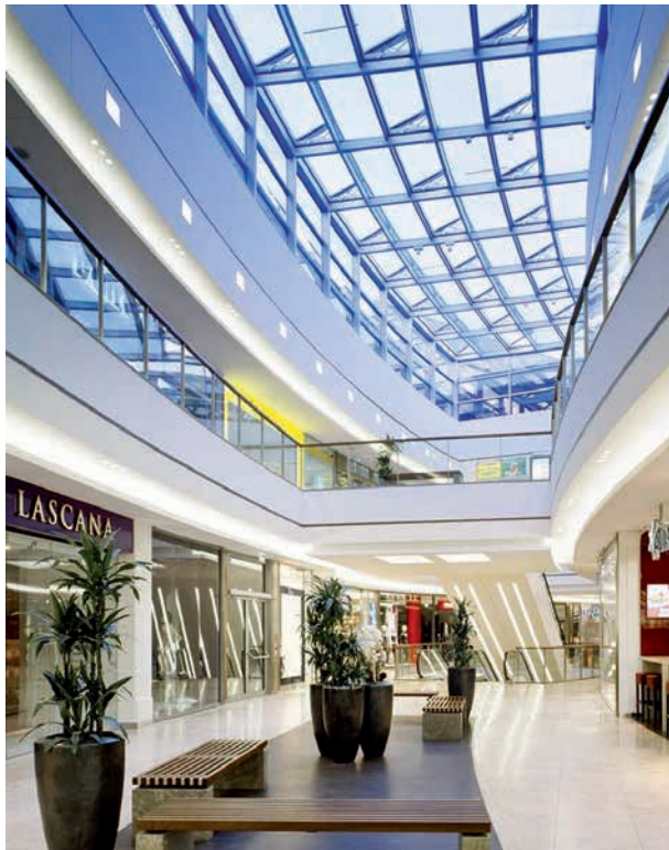
VENTRIA TG flaps installed in a flat roof