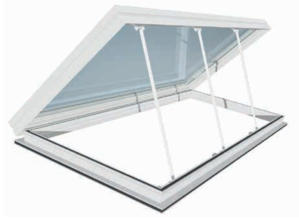
3D illustration of a VENTRIA TG flap in open position